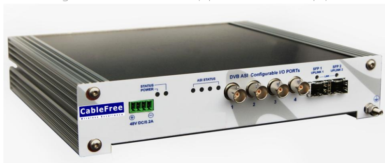
Above: DVB-ASI Module