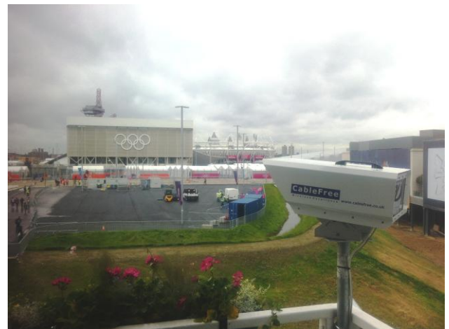
CableFree FSO links carrying live 1.485Gbps HD-SDI broadcast video streams at London 2012 Olympics